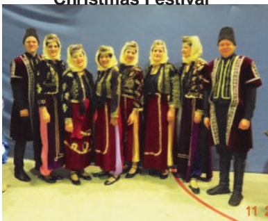
December 2015 Ukrainian Christmas Festival