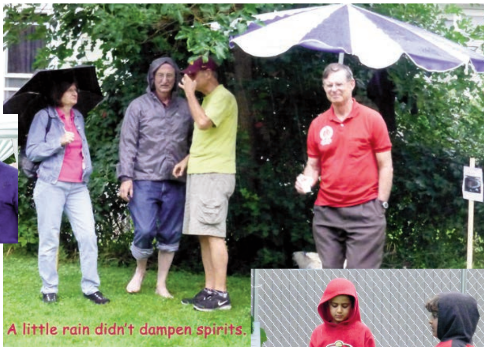
A little rain didn't dampen spirits.

Would the rain come Saturday night, or would the front stall delaying it to Sunday? All week long the forecast bounced from rain to no rain. Setup began at 4:00 on Saturday, September 14, with canopies being erected, lavash oven lit and grapes deployed in stomping pools. As we approached the 5:30 start, the rains started in earnest. In the midst of a drought, it decided to rain on our Voski Ashoun!