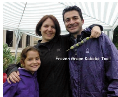
Frozen Grape Kabobs Too!